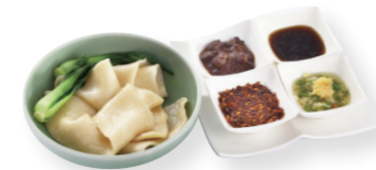
Hand Made Noodles with Chili Sauce The Guest House (請客樓)