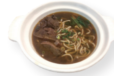
Beef Noodles Halal Chinese Beef Noodles (清真中國牛肉麵食館)