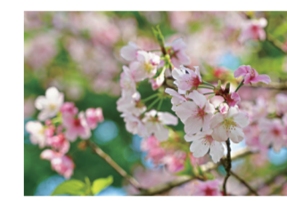
Yangmingshan Flower Festival

In summer, there are numerous exciting events staged in riverside parks. Taipei International Dragon Boat Championships, Taipei Water Festival, and Taipei Summer Festival at Dadaocheng are all events where the whole family can cool down in hot summer!