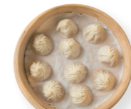
Xiaolongbao Din Tai Fung (鼎泰豐)