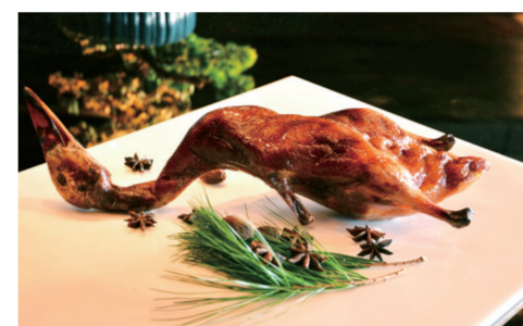
Crispy Roast Baby Duck Le Palais (頤宮)