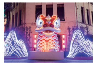
Taipei Lantern Festival