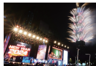
Taipei New Year's Party