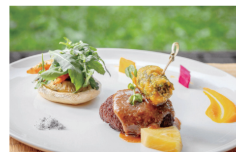
Monkey Head Mushroom Steak Yangming Spring (陽明春天)

In addition, under "Bib Gourmand", dozens of Taipei's street foods are recommended, from the famous stinky tofu, luwei (soy-braised dishes), and xiaolongbao (small steamed dumplings), to the authentic beef noodles that is a favorite of Muslim visitors, and the cold noodles, oyster omelette and heibaqie (platter with various sliced foods) on locals' dining tables every day. These authentic Taiwanese flavors are great choices for experiencing the culinary scene of Taipei.