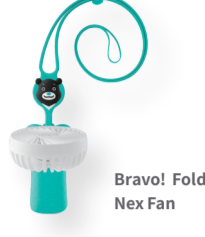
Bravo! Foldable Nex Fan