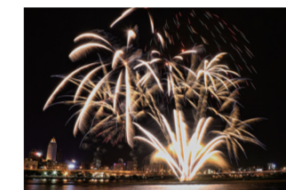
Taipei Summer Festival

Taipei Marathon, Taipei Xmas, Gongguan Christmas, Taipei New Year's Party, Taipei Lunar New Year Festival and Taipei Lantern Festival all ignite the city's passion and warm vitality as well as infuse the year's ending with great colors.